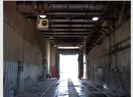
DETERIORATION OF CEILING PANELS